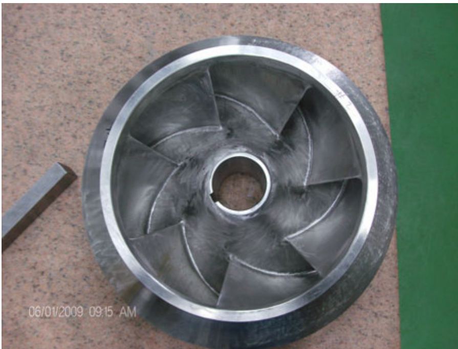
New, reverse engineered hydraulic component

This process requires in-house vane layout hydraulic technology, which may be necessary to re-engineer the deteriorated impeller and diffuser vanes. CAD software was used to overlay the new vane geometry on top of the original blade to ensure that an equivalent component was produced. The hydraulic passageways were polished to increase pump performance.